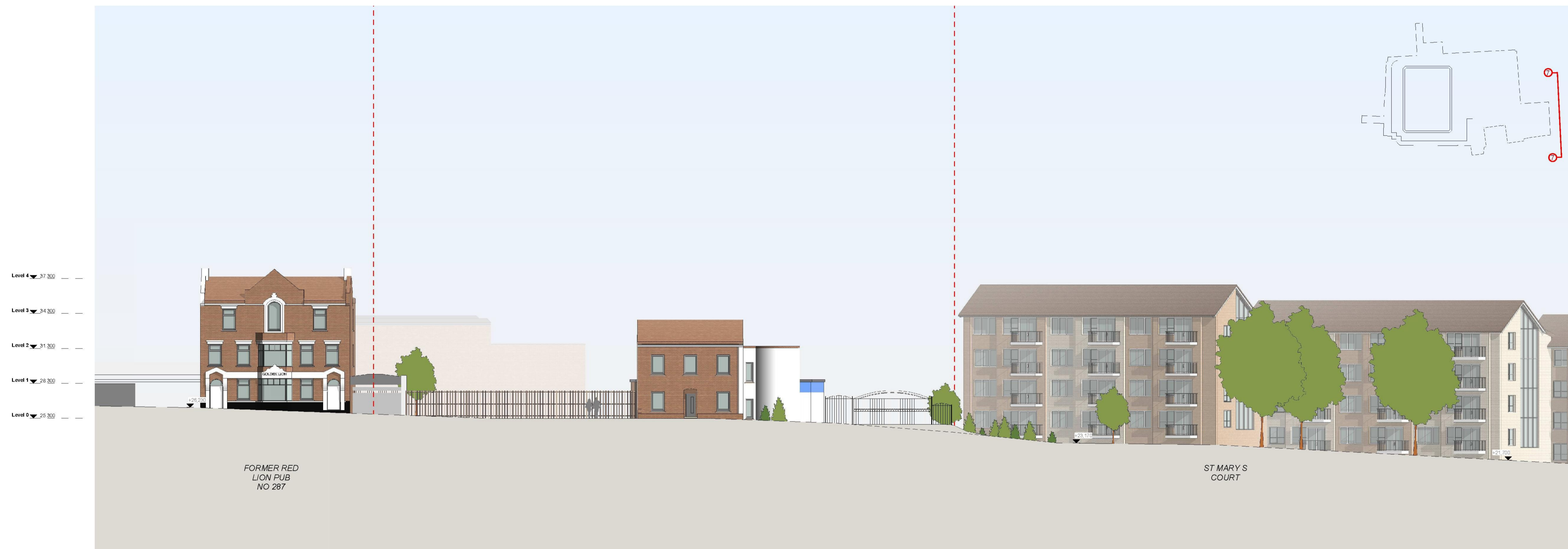
7 Existing Victoria Avenue Elevation 1:200